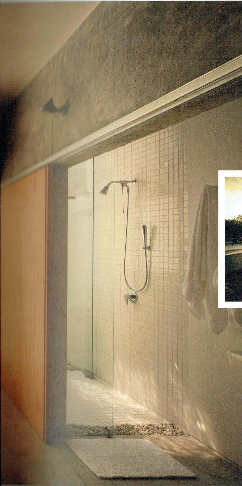
CASA MEZTITLA Tepoztlán, Mexico