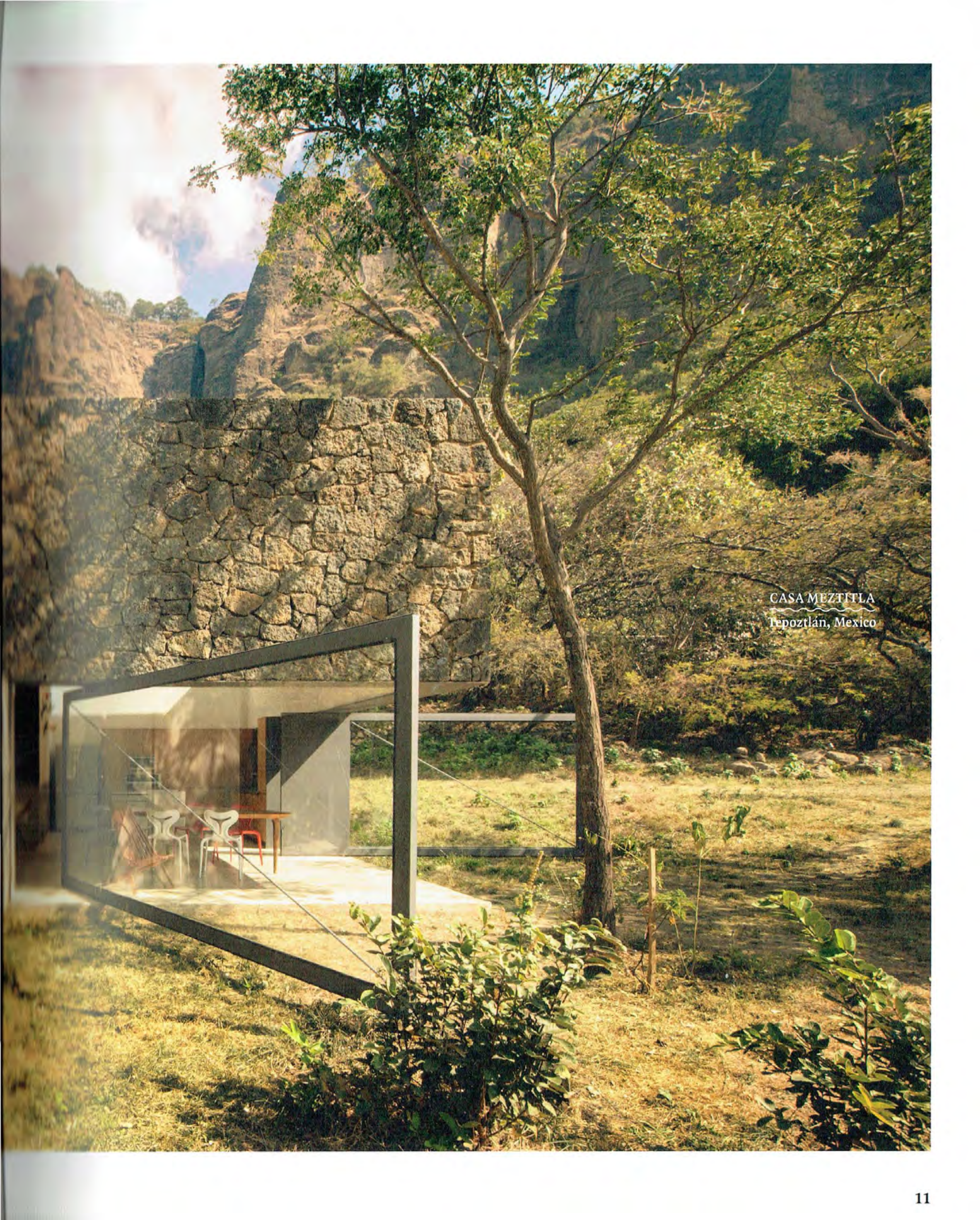
CASA MEZTITLA Tepoztlán, Mexico