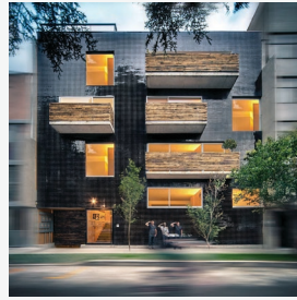
EDAA, Yácatas 475, Narvarte neighborhood, Ciudad de México

A black reflective square-shaped facade is the response to the context. It captures the neighborhood reflections and the surrounding lights, while building a special character. It integrates itself with the surroundings and it deals with the local architecture's history as reinterpreting the modernist tiles facade. It uses this long-lasting material not only for tradition and low-maintenance qualities, but also for its aesthetics properties: color and light saturation.