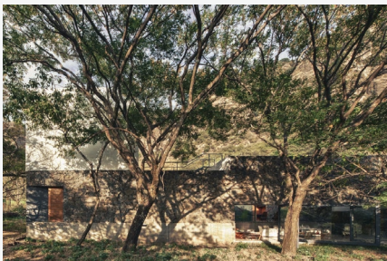
Estrategias para el Desarrollo de Arquitectura, Casa Meztitla, Meztitla, El Tepozteco, Mexico

Only two elements reveal its existence to the outside world: the colorful bougainvillea flowers showing randomly through the trees' dense foliage, which mark the plot's perimeter; and the massive and monolithic white box that emerges through the treetops.