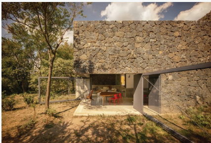
Estrategias para el Desarrollo de Arquitectura, Casa Meztitla, Meztitla, El Tepozteco, Mexico

Casa Meztitla is an intervention of a natural scenario. It showcases the luxurious value of leisure, the tropical weather, the intense sunlight, the smells of nature, the over 500 year-old landscaped terraces and the ever-present rock mountain: El Tepozteco.